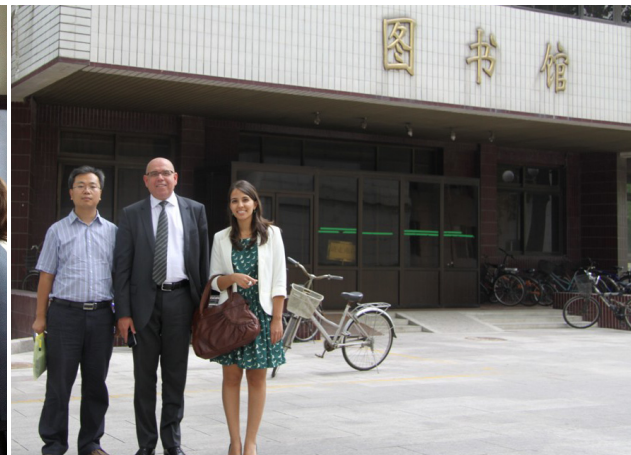
[1] [2] Visit to INRULED