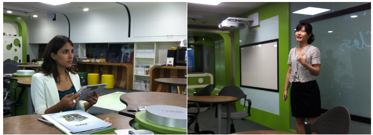
[3] [4] Visit to KERIS

research. The visit to this organization included a brief overview of KERIS' history and main projects, such as ICT in Education. Among the organization's strategic goals are the creation of smart education systems, the maximization of national research information use and the creation of educational policy support systems, and the strengthening of international cooperation and policy research. Following the institutional introduction, the delegation visited the U-classroom in order to get a sense of the learning experience offered by the future classrooms.